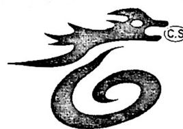
CHINA STEEL (U) LTD