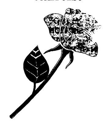
The SDP symbol of a flower representing passion for all people

Issued at Kampala this 7th day of December, 2007.